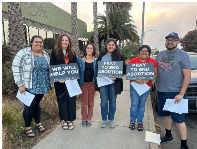
Volunteers saving lives at Santa Maria Planned Parenthood