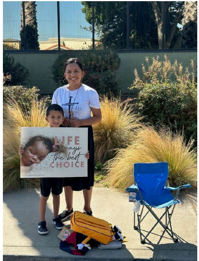
Santa Maria volunteer and son saving lives